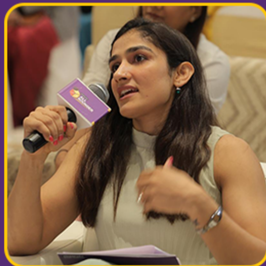
Sangeeta Phogat Ace Wrestler