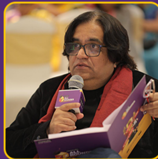
Swanand Kirkire National Award Winning Lyricist, Actor, & Playback Singer