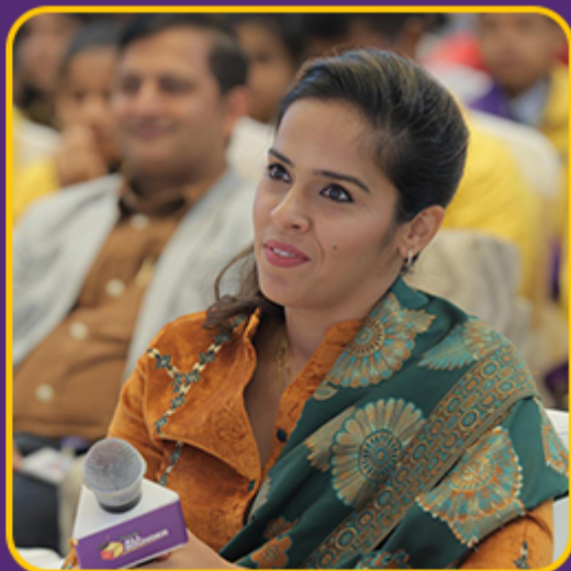
Saina Nehwal Former World No.1 in Badminton