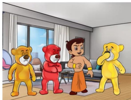
ITC Jelimals brings out "Do the 5" song to spread awareness on Covid-19 amongst kids.